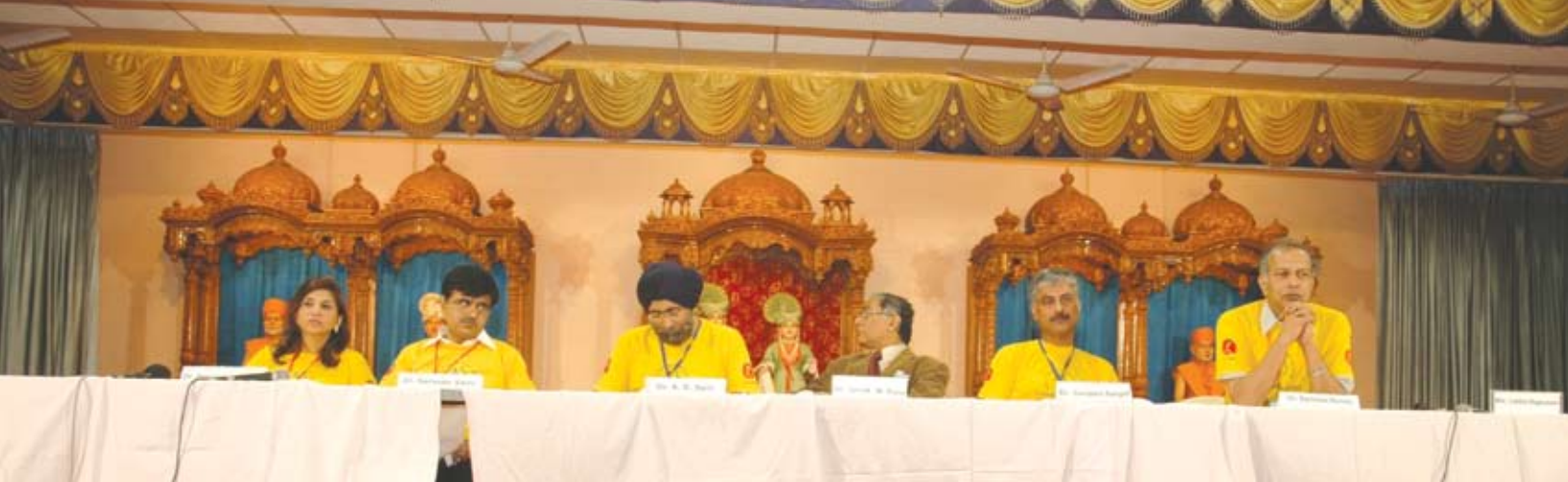
(The session in progress)

“Pledging your organs for donation can help save a lot of lives. A single brain dead person can donate as many as 30 organs and tissues and save as many as 6 lives. We need to raise awareness levels so as to ensure that more and more people pledge to donate their organs after death. It is a matter of great concern that the organ donation rate in the